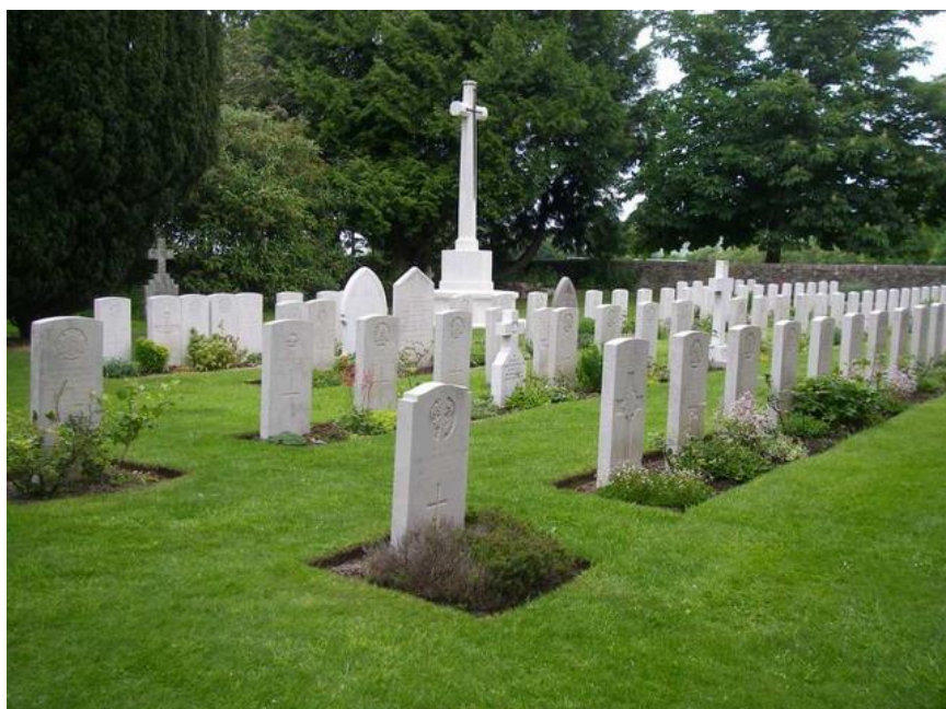
War Graves at Sutton Veny