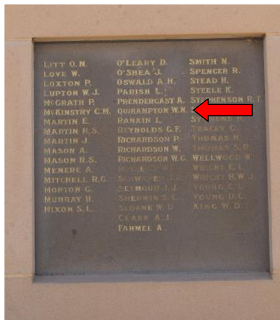
Corowa War Memorial